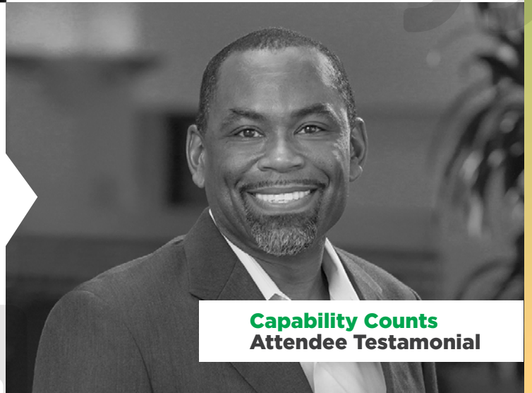
Capability Counts Attendee Testimonial