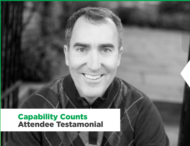
Capability Counts Attendee Testimonial

Sponsors and Exhibitors at Capability Counts have the unique opportunity to position themselves as market leaders, meet with potential customers, network with industry thought leaders, and gain competitive advantage and brand exposure at this premier two-day event.